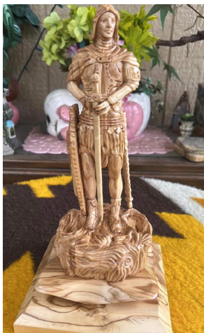
Hand carved olive wood from Bethlehem The Armor of God. Compliments of MJ & Dick Taylor

13 Therefore put on the full armor of God, so that when the day of evil comes, you may be able to stand your ground, and after you have done everything, to stand. 14 Stand firm then, with the belt of truth buckled around your waist, with the breastplate of righteousness in place, 15 and with your feet fitted with the readiness that comes from the gospel of peace. 16 In addition to all this, take up the shield of faith, with which you can extinguish all the flaming arrows of the evil one. 17 Take the helmet of salvation and the sword of the Spirit, which is the