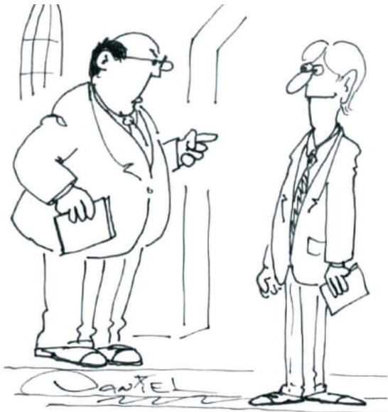
NEXT TIME WHEN I PREACH ON TITHING, DON'T SING 'JESUS PAID IT ALL' AS OUR INVITATIONAL HYMN