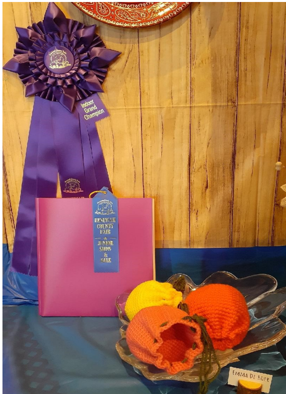
Emma DeBoer Grand Champion - Crocheting Blue Ribbon - Creative Writing